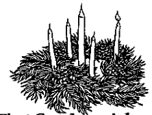
First Sunday of Advent