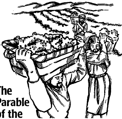
The Parable of the Workers in the Vineyard